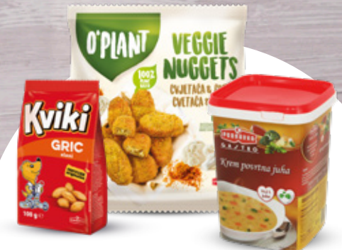
Nuggets with sauce

Oven, deep fryer or air-fryer – easy to make without any fat!